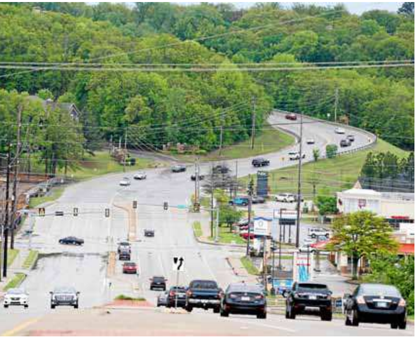
Yale Avenue narrows to two lanes as it climbs a hill south of 81st Street.